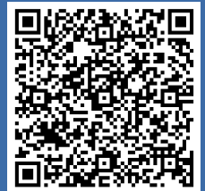
Event Sign up

SAINT AIDAN'S EPISCOPAL CHURCH 1318 WA-532, CAMANO ISLAND, 98282